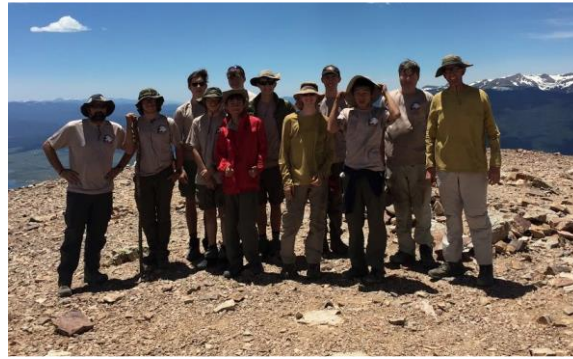
Philmont Scout Ranch.

Adventures – Usually about once a year we make an extended trip for something really exciting. Our past trips have included spending the night on the USS Lexington aircraft carrier and touring NASA in Houston. Our troop has also taken backpacking treks including treks at